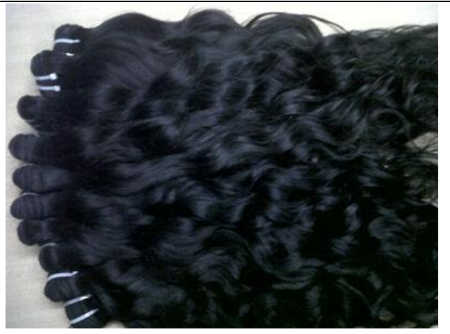
Virgin Indian Remy (Temple) Hair - Wavy machine weft