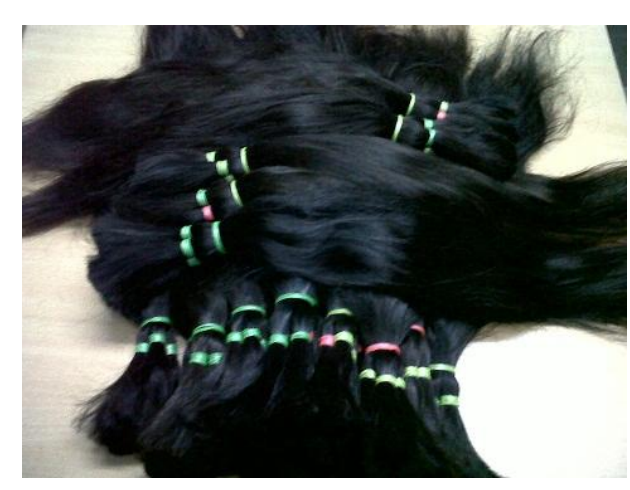
Virgin Indian Remy (Temple) Hair