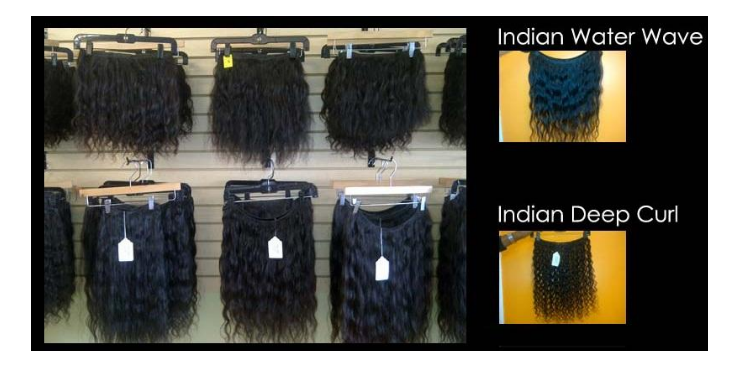
Clip-on Hair Extension – Indian Remy Hair :-