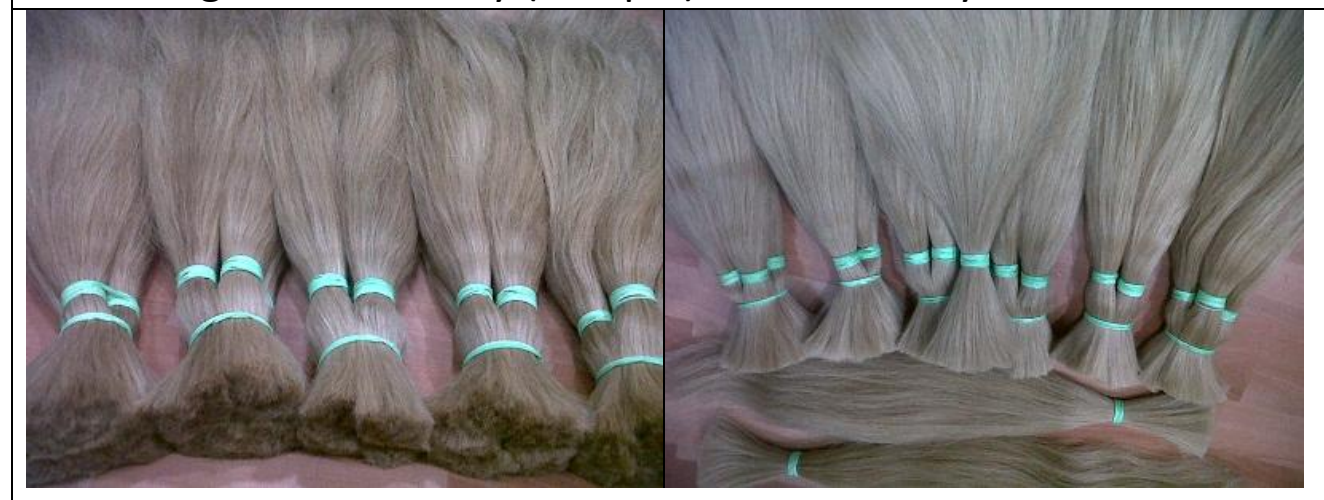
Virgin Indian Remy (Temple) Hair